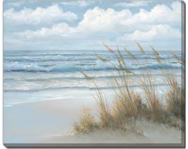
CE390-1620 [16x20] Sea Oats

Hand embellished canvas art, gallery wrapped around pine stretcher bars