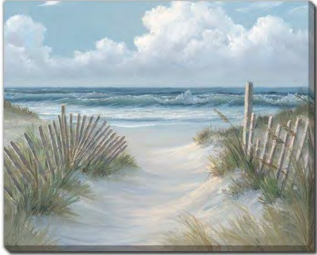
CE389-1620 [16x20] Pathway Through Dunes

Hand embellished canvas art, gallery wrapped around pine stretcher bars